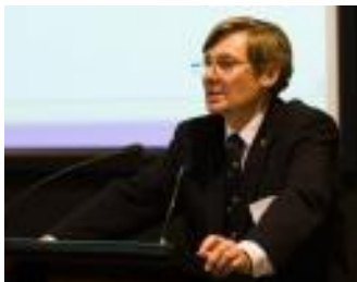
Keynote Speaker Dr John Bannon

The conference was opened by the Hon Dr John Bannon AO, the former South Australian Premier (1982-1992) who is also a respected historian. His paper entitled Highly Favoured by Nature? Mirageous South Australia , was an informative and excellent introduction to the non South Australians – Dr Bannon is a charismatic personality and an eloquent speaker.