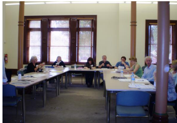
Map collection management workshop

Map Curator, Uare Taoka o Hakena/Hocken Collections, University of Otago Dunedin, NZ