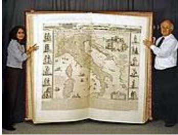
The Klencke Atlas, 1660

Magnificent Maps: Power, Propaganda and Art at the British Library 30 April 2010 to 19 September 2010